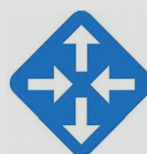
Azure Virtual Gateways