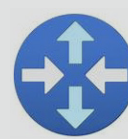
Azure Route Servers